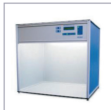
Colour evaluation chamber

This instrument follows the current regulations of the industry, it allows to evaluate, compare and analyse one or more colours (methamerism checking). The chamber can be equipped with a 45° plate and presents five different light sources, which can simulate, for example, the daylight (D65) and neon lamp (F11). The footprint is equal to 71X40,5X57 cm.