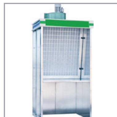
Dry spray booth

This booth is equipped with a suction system for the extraction of fumes. The overspray is retained by suitable filters built up in the frontal area, which can be cleaned and/or replaced easily and quickly.