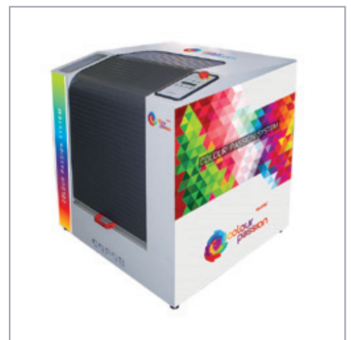
Gyroscopic mixer Clevermix 550